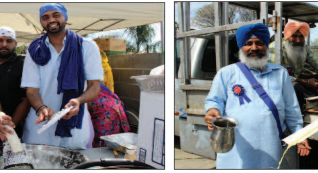
All pictures by Prem K. Chumber www.ambedkartimes.com & www.deshdoaba.com